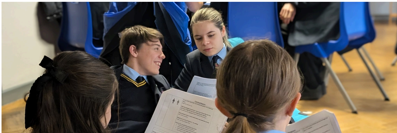
MVP STUDENTS PLANNING AHEAD OF THEIR NEXT SESSION

We've had a quiet but productive week here on the Catholic Life team! We've secured our transport for FLAME (details will be coming out for this event next week), ordered materials for our new classroom Sacred Spaces , hosted MVP here in Chapel and attended the FeedTheNeed event at St Helens Town Hall.